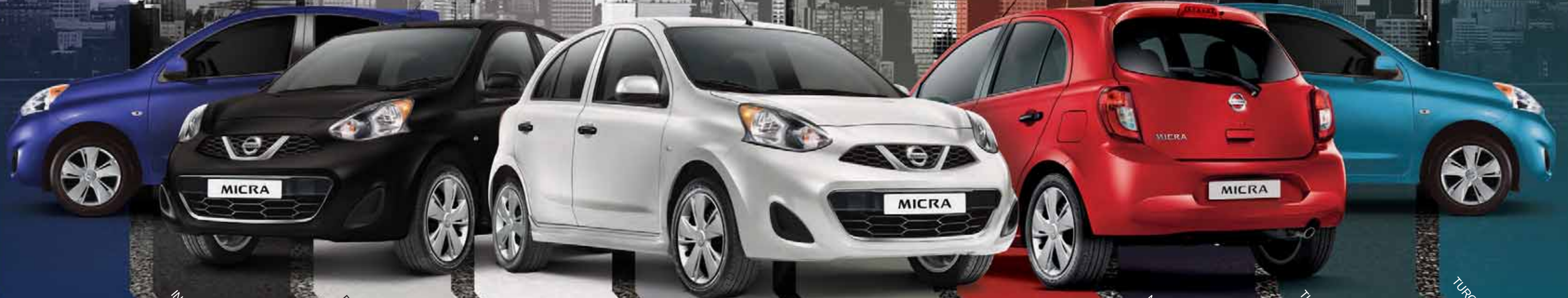
BLUE B53 (M)